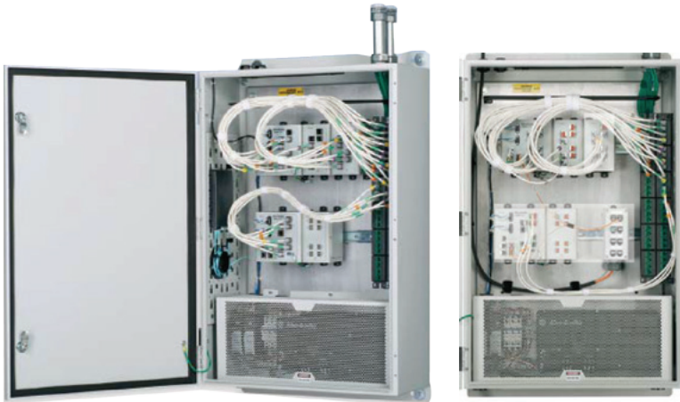
Integrated Network Zone Enclosure

To meet these requirements, Marcegaglia needed a reliable solution to withstand harsh environments, and shorten the time to perform functions ranging from diagnostics and maintenance to upgrades and expansion. This new system would also allow Marcegaglia to communicate information in real time, improving performance while maintaining quality and network security.